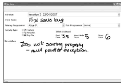
Figure 2. Handwritten electronic story card