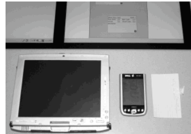
Figure 3. Size comparison of Tablet PC, Pocket PC, paper, and digital story cards

Tablet PC to create a new story, and quickly scribbles a few details about the task (Figure 2). Alice decides that she would like to work on the task as well, so she grabs the card that Charles just created with her Pocket PC. She then edits it to add her name, and places the Pocket PC back onto the iteration in order to save it. The changed card appears on the digital table in the same spot as her Pocket PC.